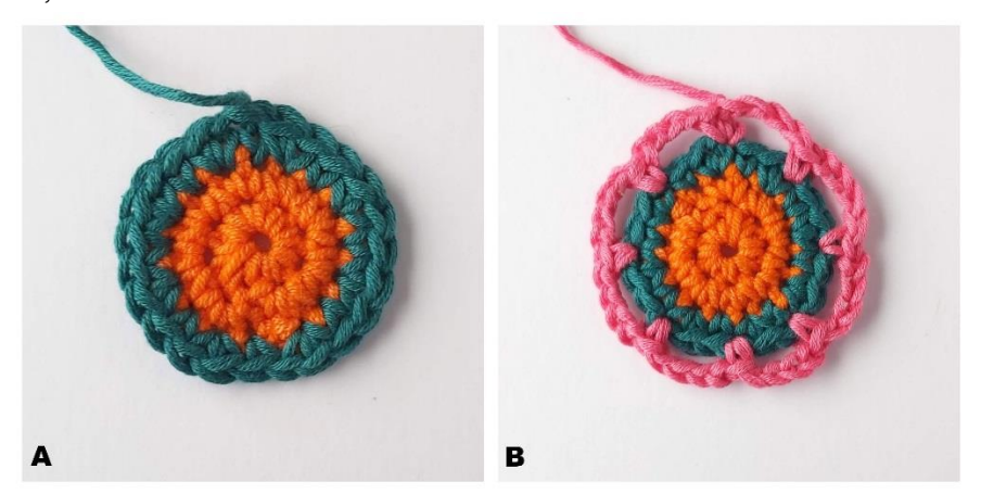
Round 5 : Using next colour, join in any sc, ch 1, 1 sc in same st, * ch 4, tr4tog ( cluster ) in next ch-4 sp, ch 4, 1 sc in next sc; rep from * 7 more times, ending with a sl st in beg sc. Fasten off yarn – 8 petals

Round 4: Join next colour in any sc, ch1, 1sc in same st, ch4, * skip 2 sts, 1sc in next st, ch4; rep from * 6 more times, join with a sl st to beg sc. Fasten off yarn - 8 sc, 8 ch-4